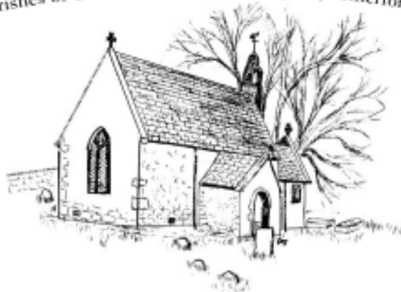
All Saints, Shorncliffe