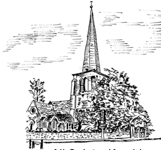
All Saints, Kemble